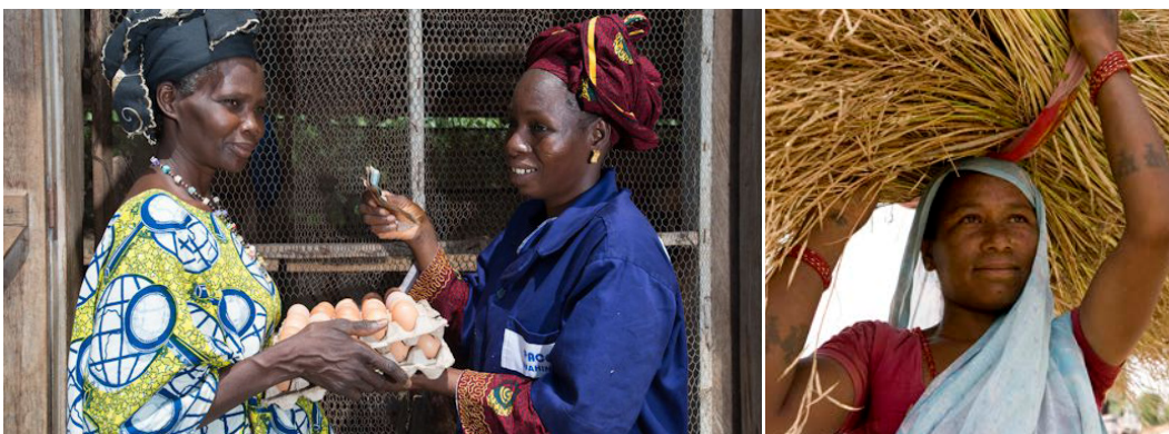
Photo left: Female livestock owner selling hens' eggs and generating income in Ivory Coast. Photo right: Female farmer in Nepal carrying her yield.

However, in spite of their important and diverse contributions, women in agriculture and rural areas have less access than men to productive resources. Gender inequality is present in many assets, inputs and services: e.g. access to or control over land, financial services, productive resources, and extension or marketing services. For example, men represent 85% of agricultural landholders in Sub-Saharan Africa. In Ghana, Madagascar and Nigeria men own more than twice the units of livestock compared to women. Similar gaps exist in access to fertilizer, mechanical equipment, new technologies, extension services and credit (UNDP 2012). Several studies have shown that gender inequality related to food security is exacerbated during crises: Women tend to become the "shock absorbers" of household food security, e.g. skipping meals, to make more food available for other household members. Moreover, women are often underrepresented in rural organizations and institutions, and are generally poorly informed regarding their rights. This prevents them from having an equal say in decision-making processes, and reduces their ability to participate in collective activities, e.g. as members of agricultural cooperatives or water user associations.