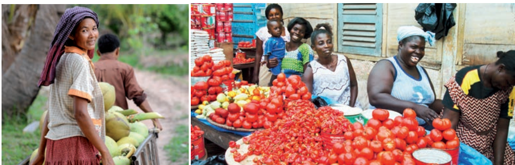
Photo left: Joint transportation of agriculture products in Cambodia. Photo right: Female traders selling tomatoes for income generation in Ghana.

Voluntary standards seek improvement in the field of management systems, product quality and quantity, marketing and trading practices (transparency), environment (soil conservation, agrichemical use) and social issues (working conditions, child labour, non-discrimination). Implementation of these standards