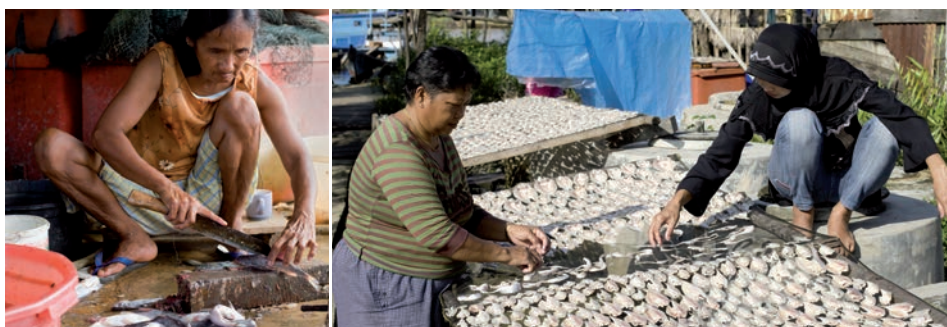
Photo left: Indonesian woman processing fish. Photo right: Women drying fish on racks for local consumption in Indonesia.

Promoting gender equality has been a fundamental principle of German development policy for many years. The following steps to action and best practices from concerned projects - implemented by Deutsche Gesellschaft für Internationale Zusammenarbeit (GIZ) GmbH on behalf of German Federal Ministry for Economic Cooperation and Development (BMZ) - have been proven essential to acknowledge and enhance women's participation in the fisheries and aquaculture sector.