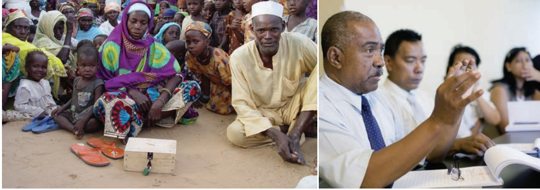
Photo left: Woman farmer in Niger managing her cooperative's saving box. Photo right: Policy makers in Madagascar discuss gender aspects in their national strategies.

Due to the above factors, among others, female farmers produce less than male farmers. This situation imposes costs on the agriculture sector, the broader economy and society, as well as on women themselves. Gender inequalities result in less food being grown, less income being earned, and higher levels of poverty and food insecurity.