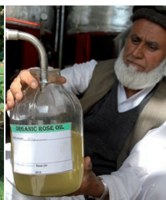
Photo left: Rose picking for organic oil production in Afghanistan. Photo right: Organic rose oil production in Afghanistan.