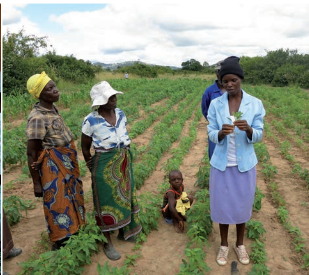
Photo left: A women owned self-organized shop in Niger provides inputs for agricultural production to its members.