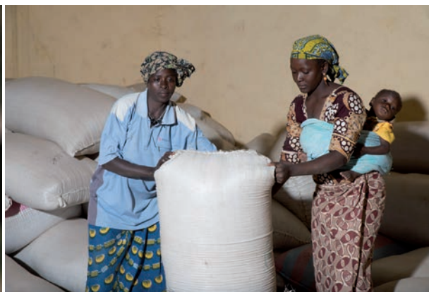
Photo left: Ethiopian woman processing grain. Photo right: Women in Burkina Faso buying cereals.