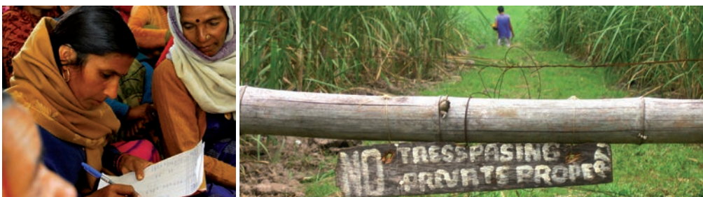
Photo left: Female farmers in India organizing themselves to claim their land rights. Photo right: Farmers on the Philippine island of Negros are prevented to access their acquired land.

Promoting gender equality has been a fundamental principle of German development policy for many years. The following steps to action and best practices from concerned projects - implemented by Deutsche Gesellschaft für Internationale Zusammenarbeit (GIZ) GmbH on behalf of German Federal Ministry for Economic Cooperation and Development (BMZ) - have proven to be successful approaches and helpful starting points to increase women's access to land.